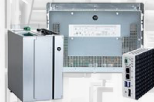
ASEM 6300B Intel Core i Class Book Mount Box PC