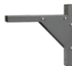
HV-2 ; 22" reach HV-3 ; 25" reach